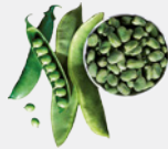
PULSES VEGETABLE PROTEIN & VITAMINS