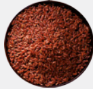
WHOLE-GRAIN RICE HIGH DIGESTIBILITY